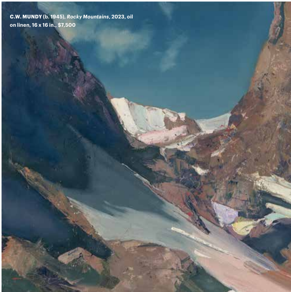
C.W. MUNDY (b. 1945), Rocky Mountains , 2023, oil on linen, 16 x 16 in., $7,500

enjoy brunch; the artists have only 90 minutes to create something memorable.