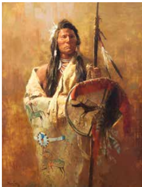
HOWARD TERPNING (b. 1927), Status Symbols , 1982, oil on canvas, 34 x 26 in., available during the Jackson Hole Art Auction, estimate: $200,000–$500,000

jacksonholechamber.com wildlifeartevents.org jacksonholeartauction.com September 6–17