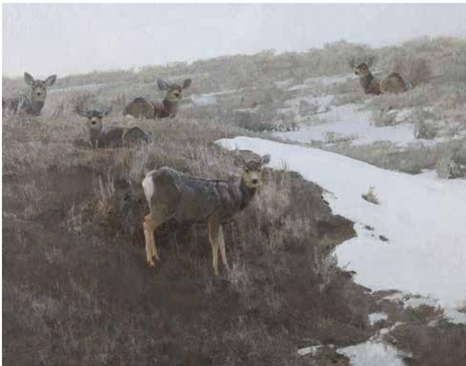
T. ALLEN LAWSON (b. 1963), January , 2023, oil on panel, 22 x 28 in., available during the Western Visions live auction, estimate: $40,000–$60,000

Every month is beautiful in Jackson, Wyoming, but September is especially so as the aspen leaves start to turn yellow and a slight chill tints the night air. In keeping with the region's