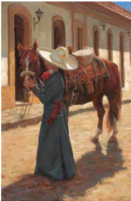
GLADYS ROLDAN-DE-MORAS (b. 1965), Encuentro , 2023, oil on linen, 36 x 24 in., $12,500

Reservations are required for the opening weekend (September 8–9), when collector-patrons will enjoy many chances to interact with the 50 top artists who have created the